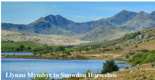
Llynau Mymbyr to Snowdon Horseshoe

Heading on through the heart of Eryri/Snowdonia with stops at the Yr Wyddfa/Mt Snowdon viewpoint en route where we learn about King Arthur's links to the area. We'll drop down through steeply sided valleys filled with boulder fields and pass the enormous Dinorwig quarry, another of North Wales' UNESCO World Heritage Sites, where slate was mined for over 200 years. We head on through Llanberis before arriving at Caernarfon's huge castle, the site of King Edward I's royal seat in Wales. We'll explore the vast castle followed by either a sit-in or take-out lunch before we head along the north coast to the bustling town of Conwy.