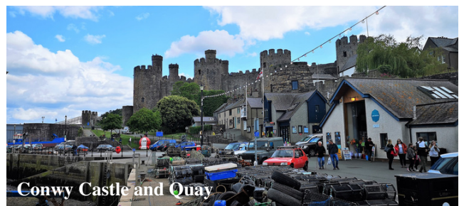
Conwy Castle and Quay

King Edward I's castle in Conwy has just been voted the most beautiful in Europe but the town also features the smallest house in Britain, the best preserved Elizabethan town house in Britain, a pretty fishing quay and a number of bustling, cobbled streets with independent and artisan shops. From Conwy, It's a short drive back to Bodysgallen Hall.