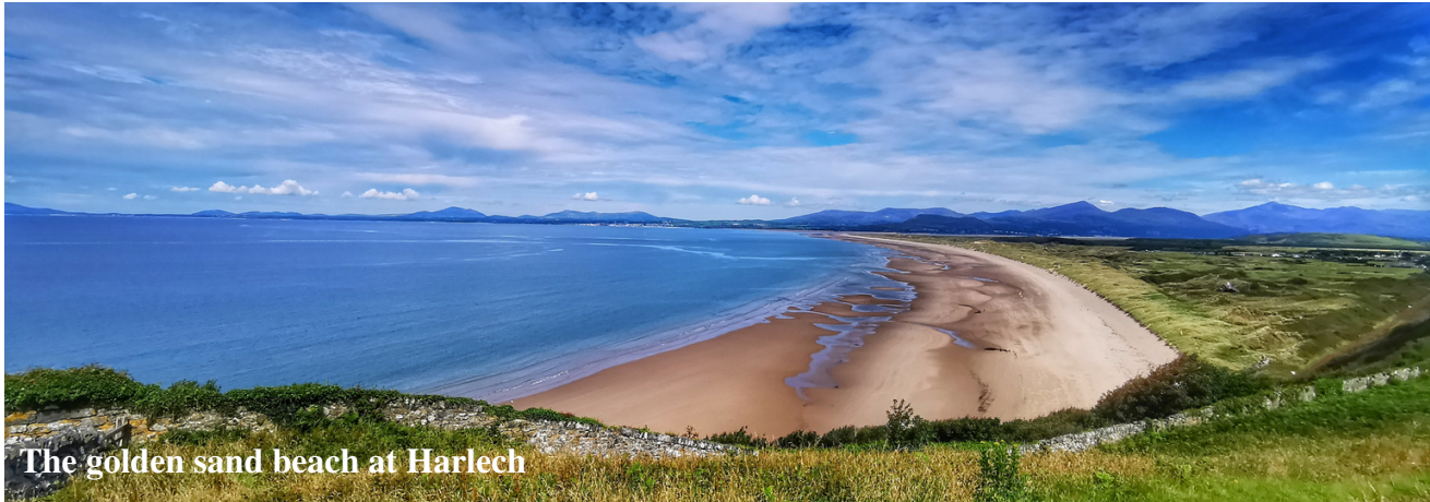
The golden sand beach at Harlech