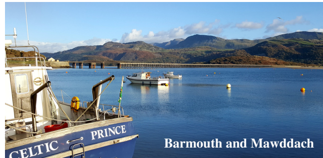
Barmouth and Mawddach

Arriving at the attractive seaside town of Barmouth, we can hike up to the first land owned by the National Trust, offering amazing views. Next, we head north to Harlech Castle where we learn about the conquest of Wales by King Edward I in the late 1200s. We will also learn about the legend of Bran and Branwen, and their links to the Tower of London and the Holy Grail, predating King Edward I by many hundreds of years.