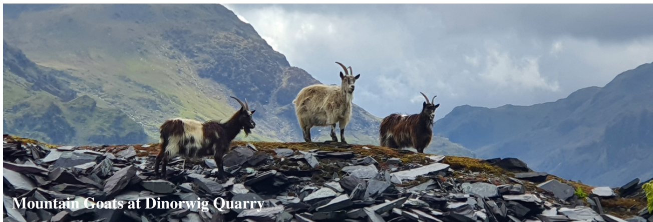
Mountain Goats at Dinorwig Quarry