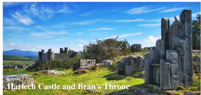
Harlech Castle and Bran's Throne

Today's castles are all World Heritage sites and are described by UNESCO as 'the most important examples of medieval military architecture in Europe' and 'the zenith of English castle building'. Our luxury touring vehicle will head south down the Conwy valley, over the Crimea pass and across to the West Coast where we find the famous Harlech Castle perched on what seems like an inaccessible rock. Learn about the legend of Bran and Branwen and their links to the Tower of London and the Holy Grail and about the last great rebellion of the Welsh led by the heroic local, Owain Glyndwr.