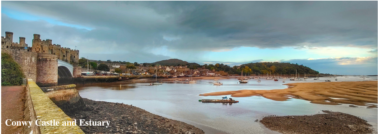
Conwy Castle and Estuary