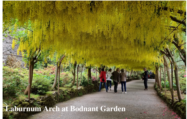
Laburnum Arch at Bodnant Garden

This tour begins in Conwy, with a visit to the bustling town, where we can visit King Edward I's magnificent Castle built between 1283 and 1287, or walk around the pretty medieval town with its cobbled streets and artisan shops. We then continue on a short drive to Bodnant Garden, one of the UK's best horticultural gardens featuring plants and flowers from all over the world. Renowned for its camellias and azalea display in Spring, late May into June is also a great time to visit when Bodnant's world famous Laburnum Arch is in full flower.