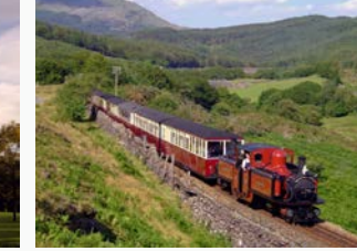
West Highland Railway